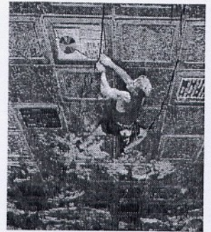
To succeed in a global economy, we must climb to new heights!