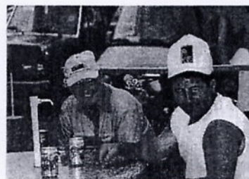
Taking in the best of the Beer Gardens!