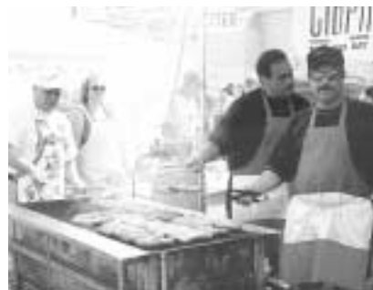
Just a few of the volunteers who made the CIBPA's presence at Festa Italiana a success.

Until next festa, stay well, be happy, and love like you have never been hurt. Mille Grazie e tante belle cose.