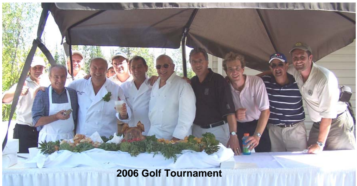
2006 Golf Tournament