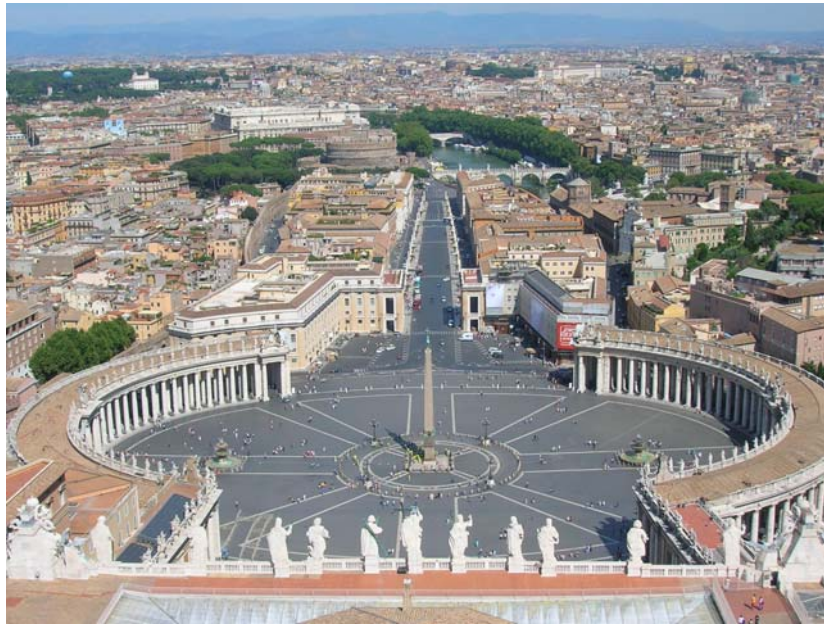
Panoramic View of St Peter's Square and Rome taken from the Vatican Coppola